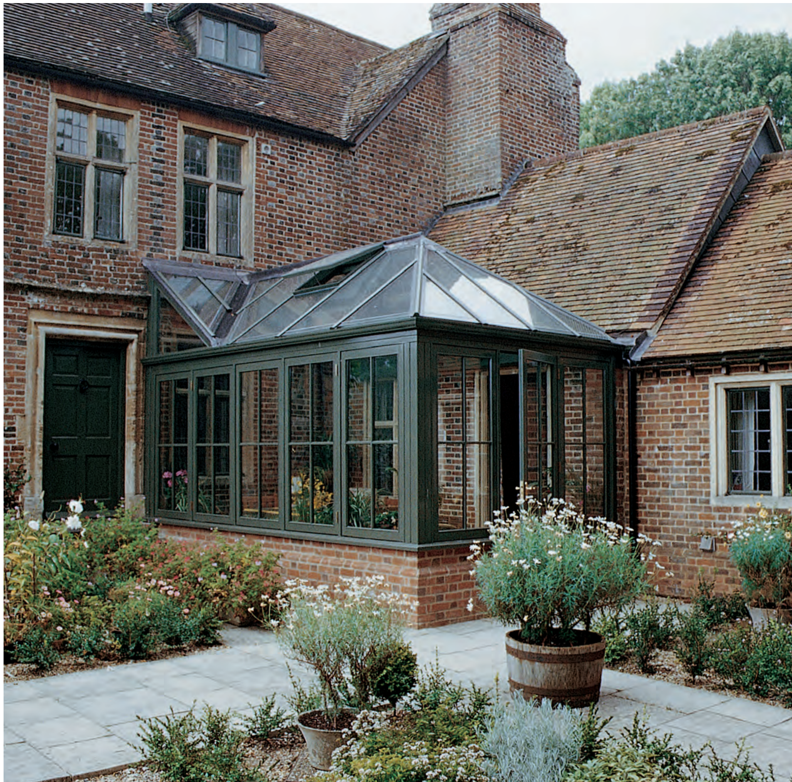
above This listed building required sympathetic detailing to accommodate period features