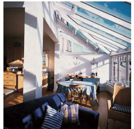
right This extensive conservatory provides both sitting and dining areas in a light-filled setting