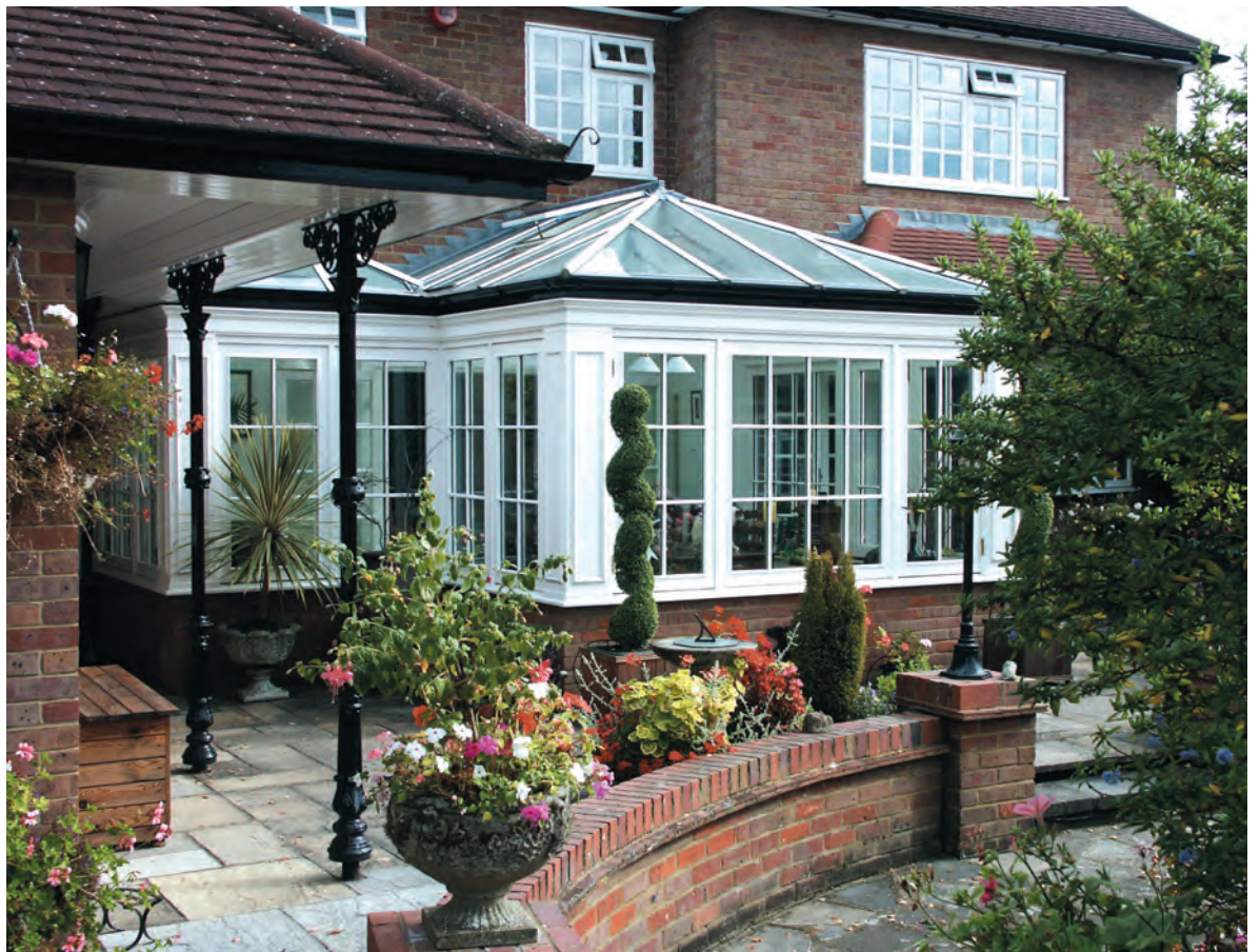
above Existing garden features can be accommodated by sympathetic conservatory design

Whatever the season, a conservatory will soften the threshold between house and garden and bring the benefits of natural light and garden views into the heart of your home. Malbrook are experienced at ensuring your new conservatory is sensitively designed and constructed to work in harmony with the features and layout of your garden for year round enjoyment.