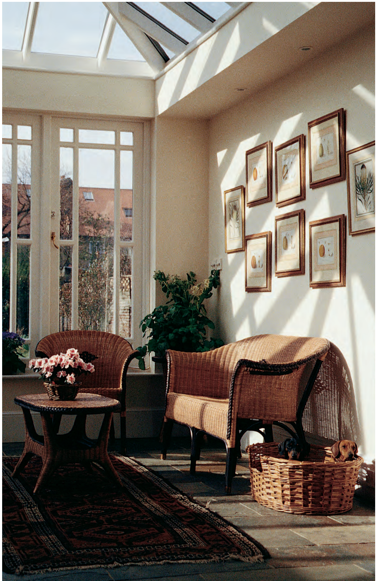
right An orangery can give a more solid appearance and provide useful internal wall space