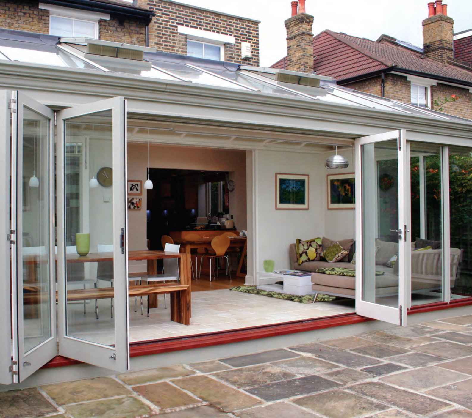
above Folding sliding doors open up this dining/living area to the paved stone terrace and garden