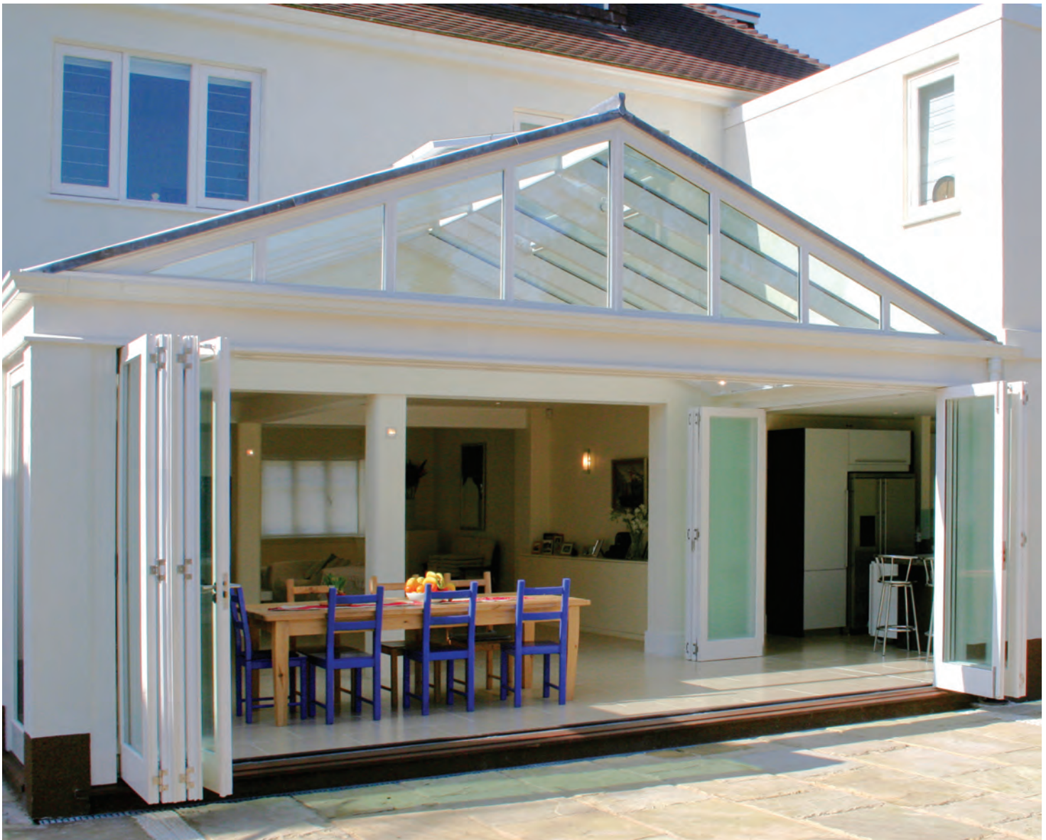
above and left Folding sliding doors can be incorporated into most conservatory or orangery designs