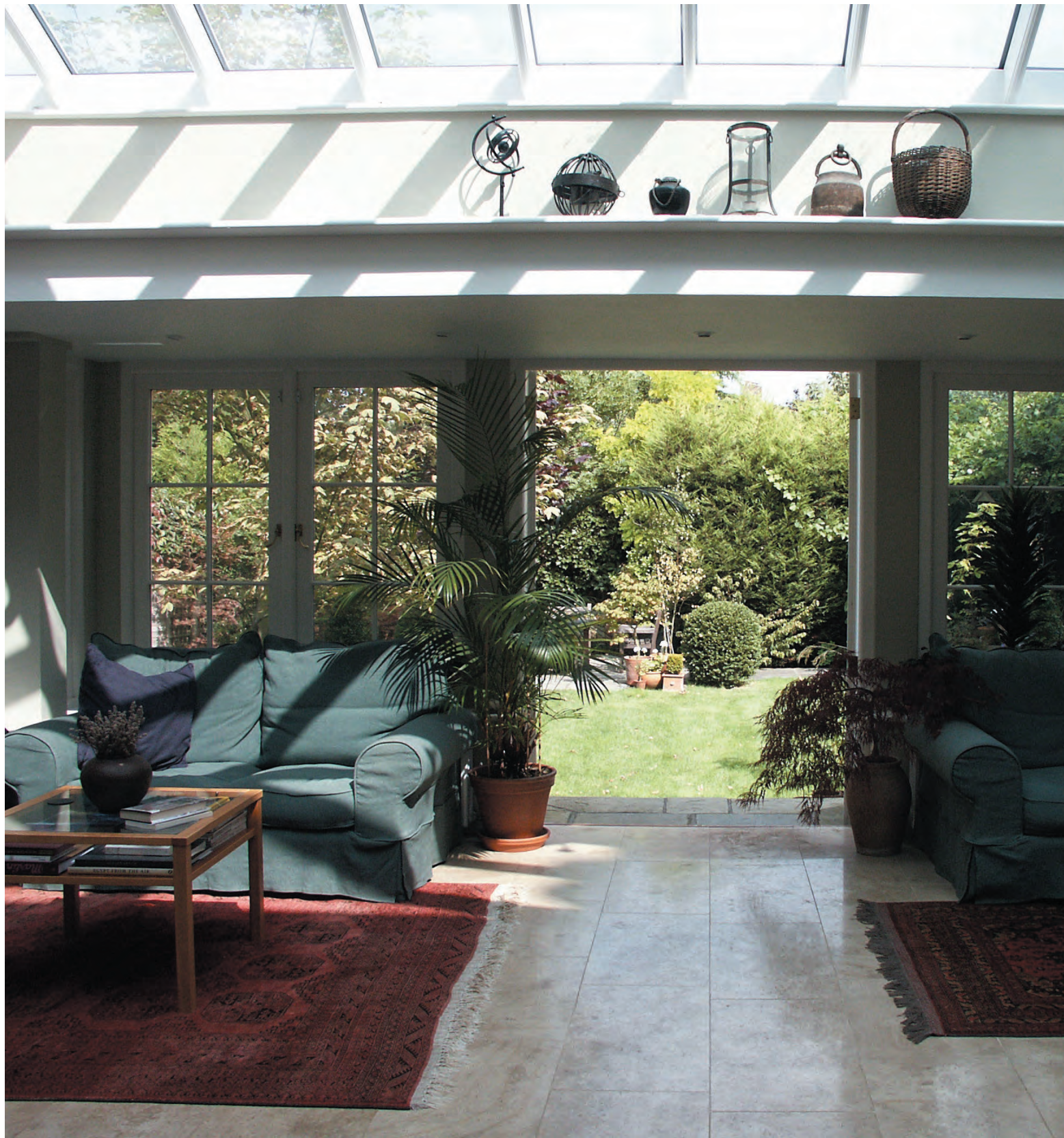
above A smooth transition from conservatory to garden is achieved by wide double doors and attention to floor levels