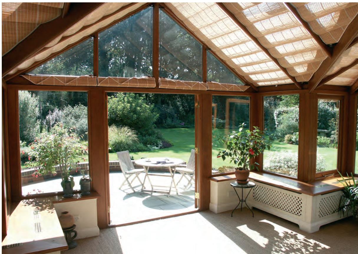
above This conservatory leads smoothly onto a terraced area with views from both to the garden and beyond

A conservatory creates the opportunity to frame views of your garden, as well as providing a place in your home to relax and admire the view in all seasons. From initial design drawings to planning and construction, Malbrook offers you a full and wholly individual service to create your new room with a view.