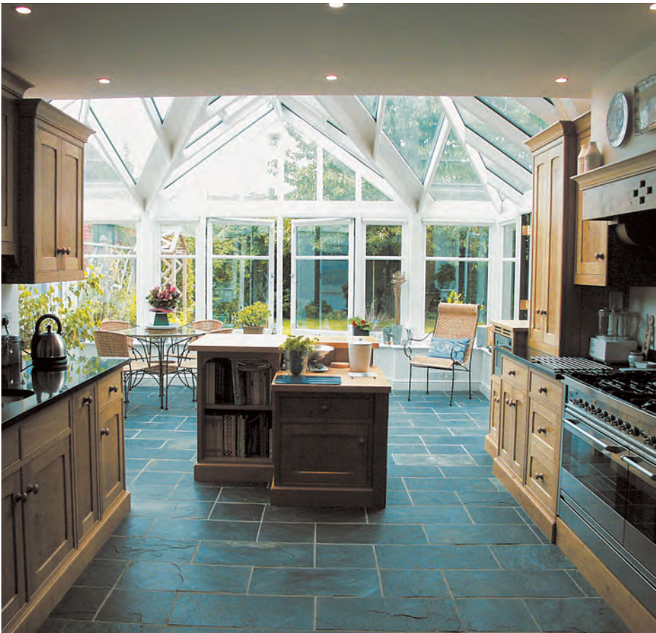
above and left The prominent gables of this house were matched by the conservatory design, whilst inside, a previously gloomy kitchen was transformed into a light-filled space