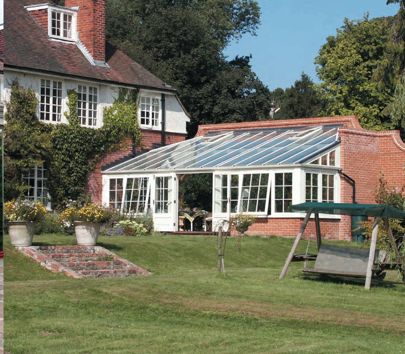
above This conservatory provides a classic glasshouse extension with extensive interior planting

For more information To discuss your project or arrange for a designer to visit please telephone 020 8780 5522 or email info@malbrook.co.uk or visit: www.malbrook.co.uk