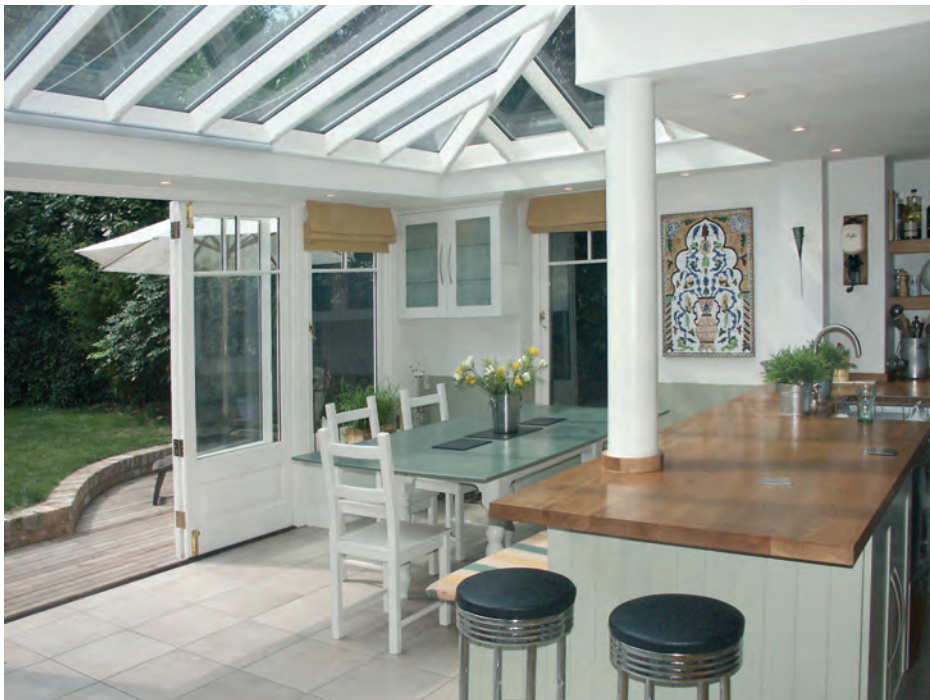
above Conservatories are often used as kitchen extensions, offering both increased light and space for dining

A well-planned extension has the ability to change the way you use the spaces in your home. It can link previously separated areas such as a kitchen and dining room to become the heart of your home. Alternatively it can provide a secluded place removed from the noise and activity of family life.