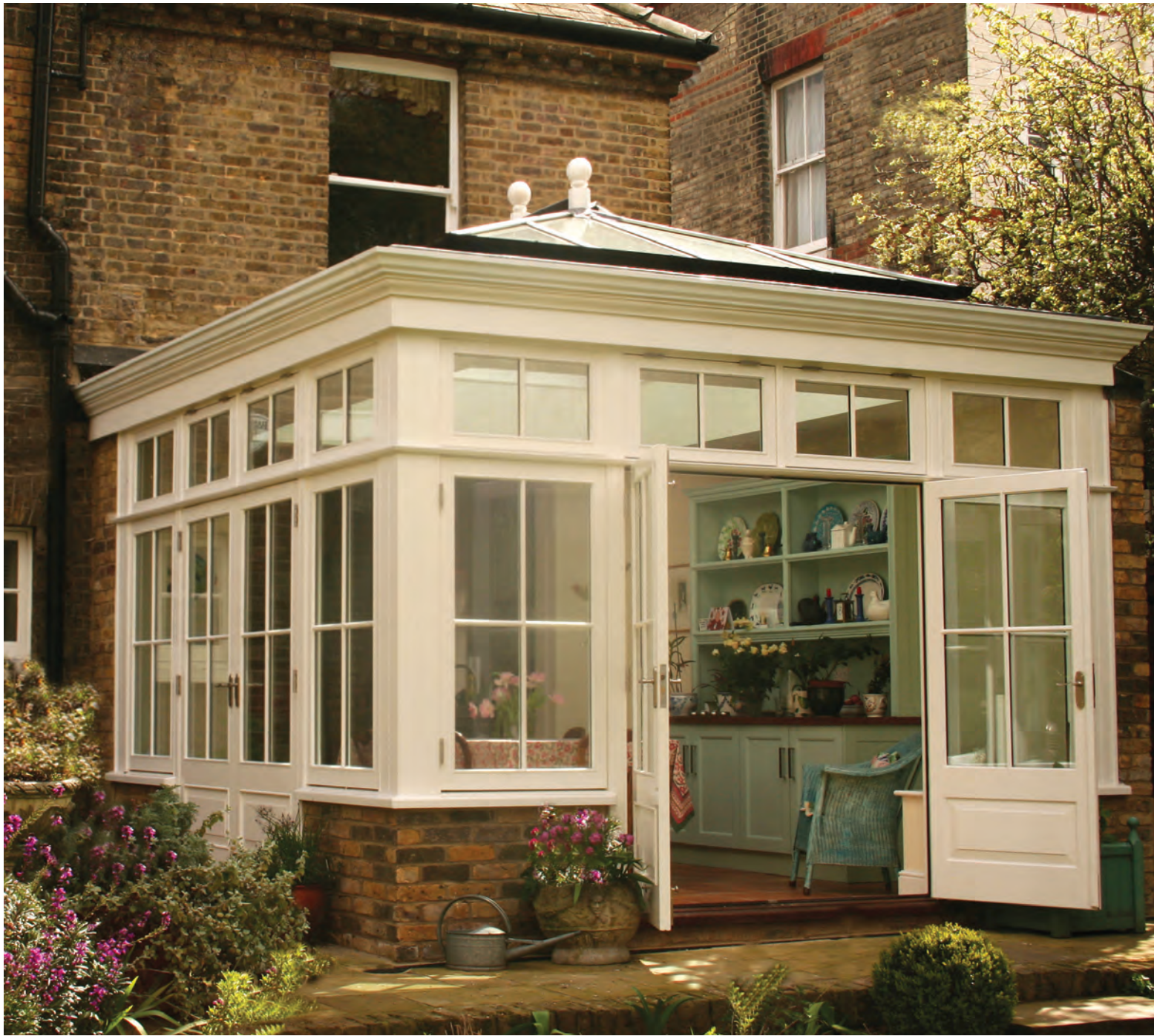
above Clerestory windows help to create an elevated design with inset roof lantern and finials