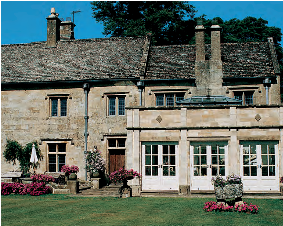
above The proportions of this Cotswold property were carefully matched by the orangery extension

The orangery type glasshouse was originally developed for the cultivation of orange trees in the cooler British climate. This is generally a substantial extension combining solid walls with a glazed roof. An orangery provides an interesting alternative to a conservatory.