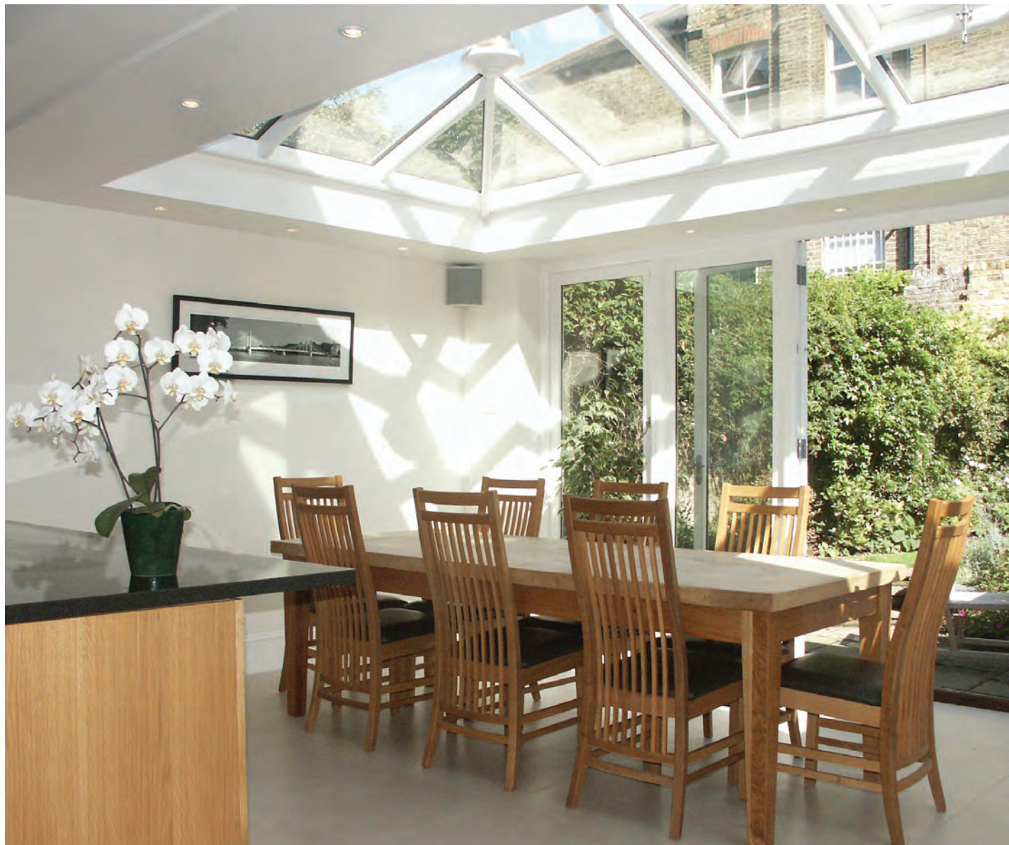
above A roof lantern above a contemporary dining area

An inset roof lantern can provide improved natural light and an opportunity to introduce low voltage lighting to a new or existing space.